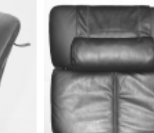
Secure with either Pillow with Hook and Loop