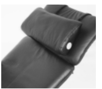
Air Control Adjustment Valve