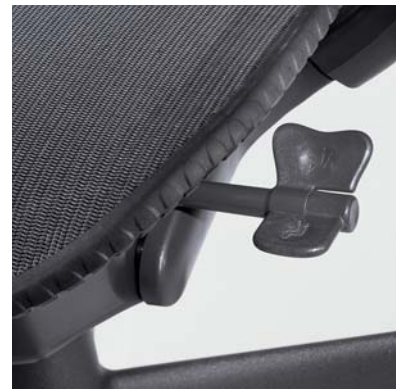
Fitting the sitter and task