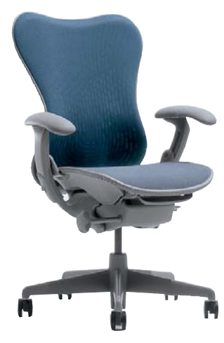
Mirra chair with upholstered back option