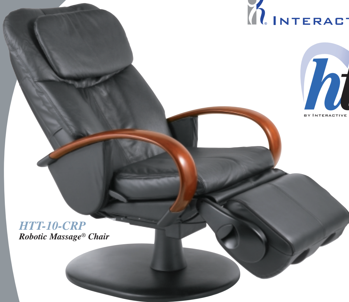
HTT-10-CRP Robotic Massage ® Chair

htt ® human touch technology BY INTERACTIVE HEALTH