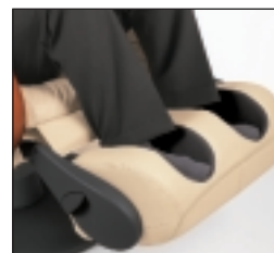
The Rotating calf and foot massage footrest massages your calves or your feet.