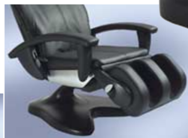
Rotating Multi-Speed Foot and Calf Massager Feels like strong hands providing a powerful three-dimensional massage for your calves or feet.